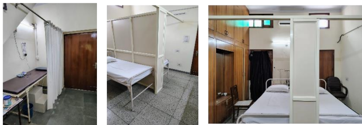
Nursing and patient Room