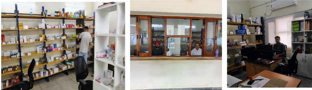
Reception and Pharmacy/ Dispensary